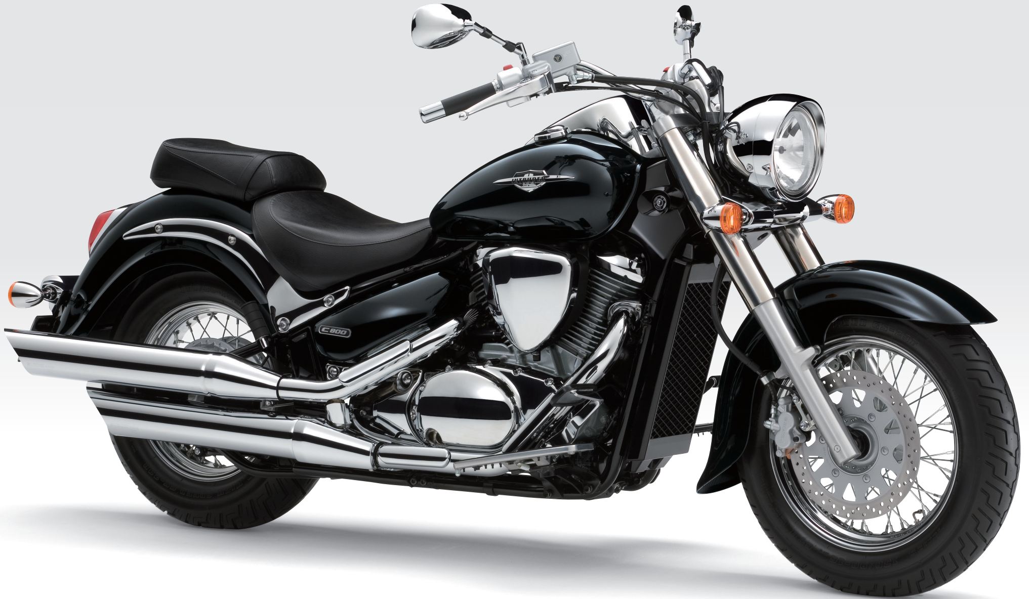
Photo : INTRUDER C800