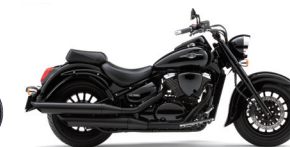
Glass Sparkle Black (YVB) Photo : VL800B

Specifications, appearance, colors (including body color), equipment, materials and other aspects of the "SUZUKI" products shown in this catalogue are subject to change by Suzuki at any time without notice, and they may vary depending on local conditions or requirements. Some models are not available in some regions. Each model may be discontinued without notice. Please inquire at your local dealer for details of any such changes.