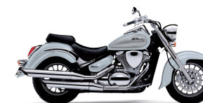
Pearl Bracing White / Metallic Mystic Silver (ARA) Photo : VL800C